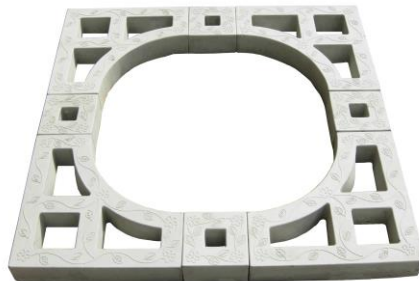
TG-3 950x950x75mm, ID 650mm