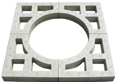
TG-2 800x800x75mm, ID 500mm